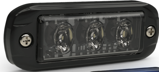
Single-colour P/N: CD3601X