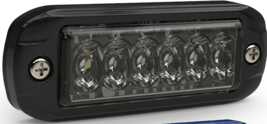
Dual-colour P/N: CD3602XX