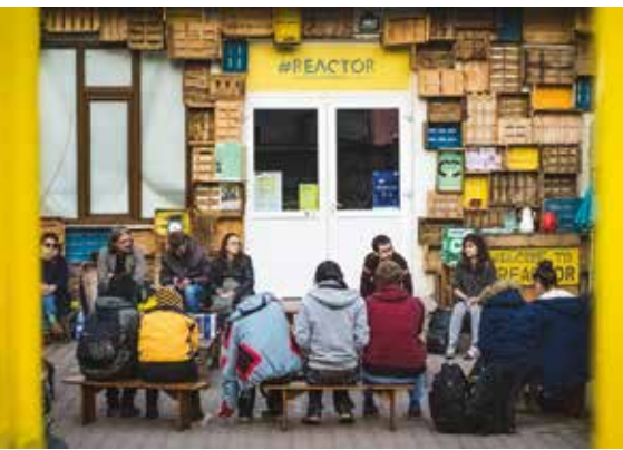
Reactor • photo: Courtesy of Oana Mardare