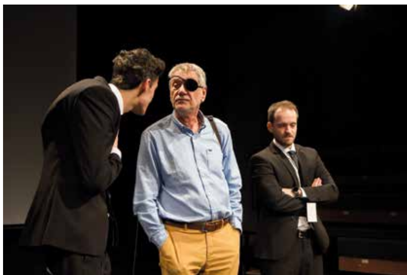
Not your business, directed by Alexandru Dabija

contained a Directorate for the Performing Arts (today known as a "Service"). The number of theatre institutions subsidised from the state budget has fallen, especially after the rushed legislative measures introduced with a view to decentralisation: with the exception of the national theatres, all other theatres have been subordinated to and are funded by local authorities, with many finding themselves unprepared by this measure, first initiated in 1996 and then put into law in 2006 and, again, in 2017. Interestingly, in its first ever issue, published in 2009, Scena.ro magazine discussed the debate surrounding this issue, i.e. decentralisation, in terms of the consequences it would have for the national theatres.