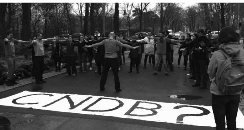
Dancers protesting in front of the Ministry of Culture

of targets: performative practices, man's relationship with technology, embodiment, the application of non-anthropocentric/non-bipedal perspectives (i.e. those that do not place man at the centre of the universe), interaction with the public, and the criticism of collecting as an accumulation of luxury objects and the transformation of live, performative work into an appendix to art objects. The performance took place in a pavilion designed by Andrei Dinu, an igloo which took its inspiration from Buckminster Fuller's geodesic dome (and which will be recycled afterwards in a gesture of environmental awareness). However, what Aggregate sought to achieve first and foremost was to express an artistic opposition to the obsession with luxury, the obscene level of investment in art objects and not in art itself, i.e. in the object and not in the human. Presented at a luxury art fair, Pirici's work sabotaged the very context in which it was performed.