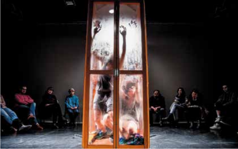
Cvartet pentru lavalieră , 2016