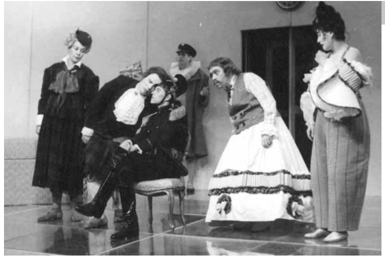
The bald soprano, directed by Gabor Tompa, Cluj Hungarian Theatre, 1993

Like a summer storm that threatens to destroy everything in its path but is over in