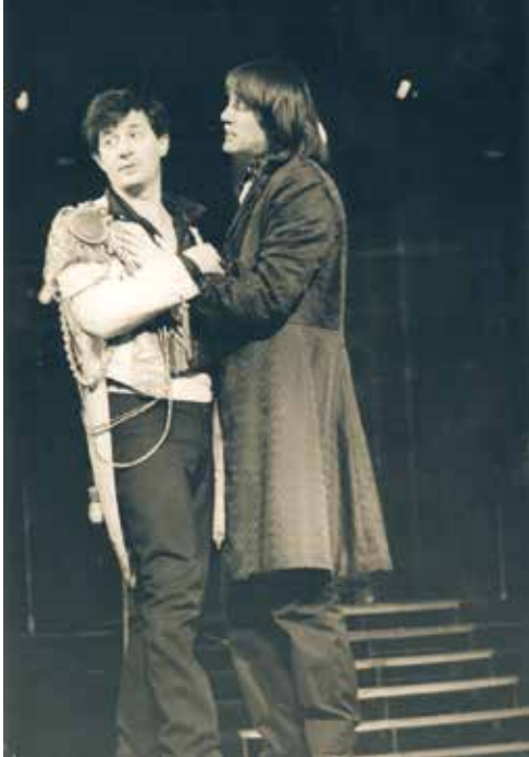
Ion Caramitru and Marcel Iureş in Hamlet, directed by Alexandru Tocilescu