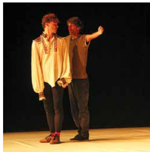
Ciocanul fără stăpân

Ciocanul fără stăpân is an iconic work of Romanian contemporary dance. Set to the music of Pierre Boulez, it was produced by Stere Popescu in 1965 for the National Opera in Bucharest, also being performed that same year at the Festival de Danse in Paris, where it sparked controversy. However, the political context at home, where the communist regime was promoting Proletkultism, was not favourable to the avant-garde. Accused of decadence (a notion which at the time also included alternative sexual orientations, which were considered a crime, and what with Stere himself being gay), the choreographer did not return to Romania, instead applying for political asylum in France. He would later move to London, where, in 1968, he