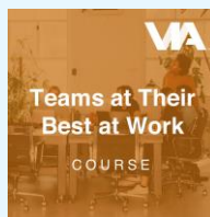
Teams at Their Best at Work