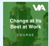
Change at Its Best