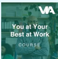
You at Your Best at Work

$149.00 per learning path $49.00 per certification