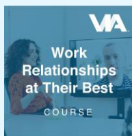
Work Relationships at Their Best