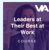
Leaders at Their Best at Work