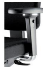
3D 360° ALU