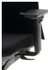
Idea soft 3D±20°