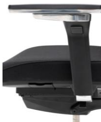
Idea XD ALU