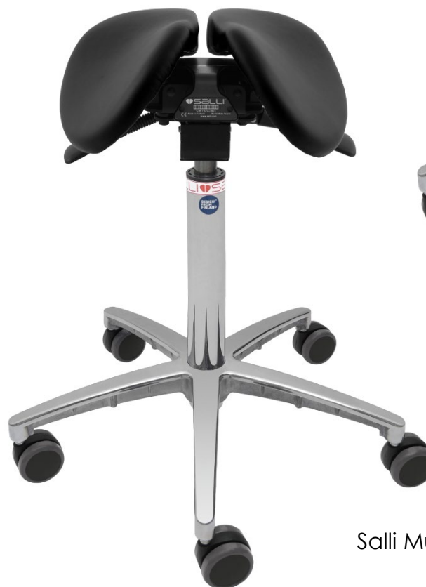
Salli MultiAdjuster Small