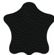
KAB Leather Black