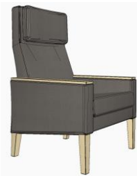
Upholstered with wooden cover