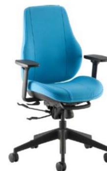
Step+ F23 + armrest