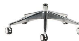
Aluminium (available also as black painted aluminium)