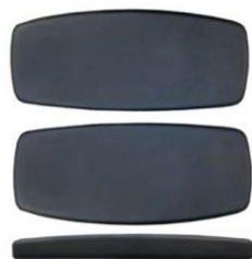
Asymmetrical shape from above and side