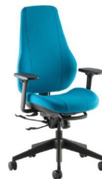
Step+ F26+ armrest