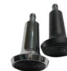
Pads; black or aluminium