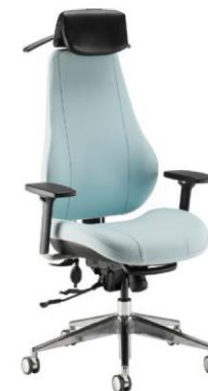
Step+ F37C + armrest + coat hanger (C= lumbar support)