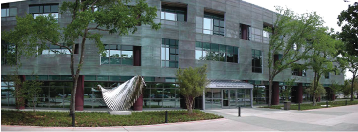
1. Center for BrainHealth/Goad Building