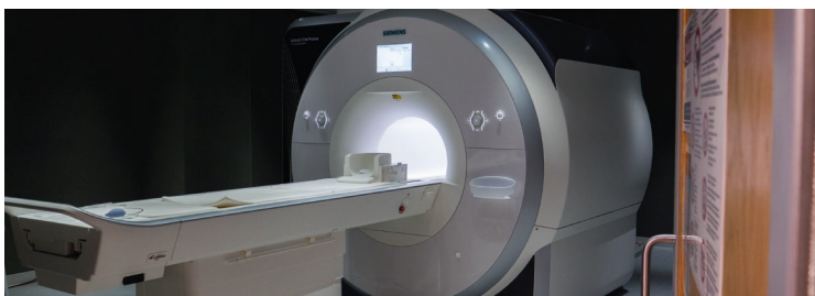
3. Sammons BrainHealth Imaging Center