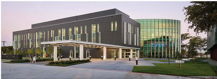
1. Brain Performance Institute and UT Dallas BrainHealth Imaging Center