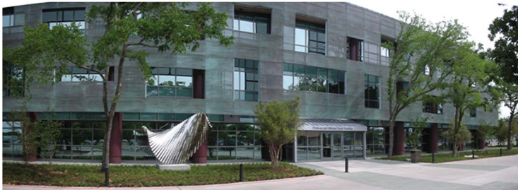
2. Center for BrainHealth