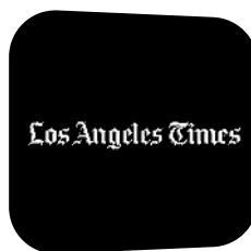
LOS ANGELES TIMES