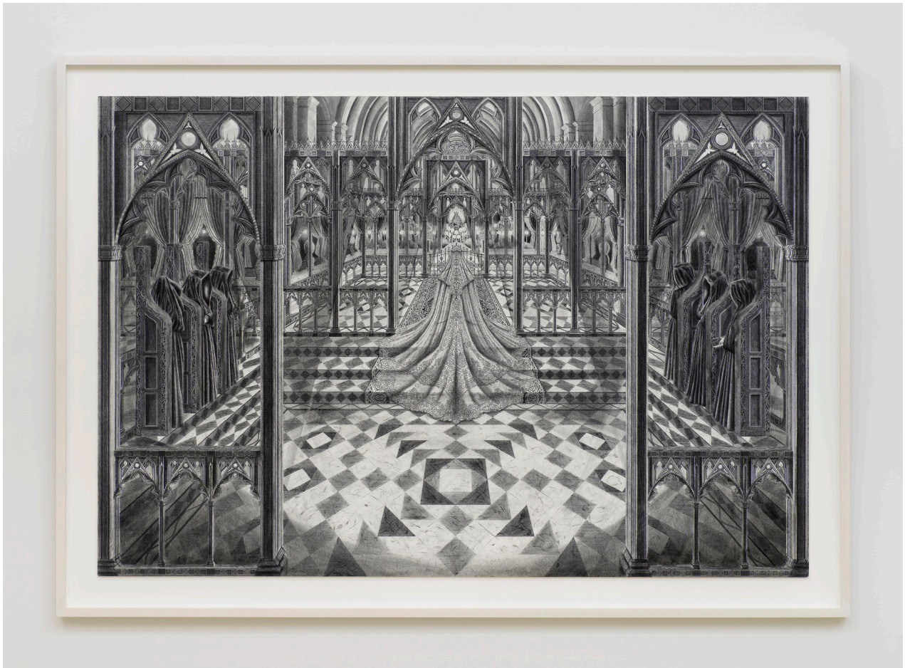
Kyung-Me, The Marriage , 2022, pen and charcoal on paper, 32 by 47 ½ inches.

A rigorous sense of order rules the drawings in New York-based artist Kyung-Me's first solo exhibition at Bureau, on the Lower East Side. Mirrors, columns, curtains, room dividers, spotlights, and frieze-like elements form geometrical divisions in the symmetrical compositions, each nearly three feet tall by four feet wide. The scenes are set in two spaces meant to evoke otherworldly beauty: the okiya, where geishas sit or lie in silence, and the convent, where nuns in elaborate robes orient themselves toward unseen presences. Despite the show's title, "Sister," the women centered in most of the images appear isolated, tied to their elaborate environs more than other human figures. Viewers can get lost in the details, all rendered in cross-hatched pen lines and charcoal gradients on paper. But examination comes with the sense that one might discover something darker lurking in the shadows, or in the additional rooms just visible at the edges of some drawings. The Fall , a small piece at the start of the show, depicts a woman on the threshold of a forest of twisted trees, foreshadowing the religious and psychological tensions pulsing underneath Kyung-Me's visions. Below, the artist discusses these tensions and the origins of an enigmatic body of work. —Mira Dayal