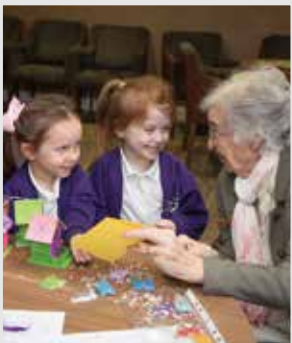
The Nursery in Belong joins intergenerational research project Page 5

Work resumes at Belong Birkdale: see pages 2 and 3