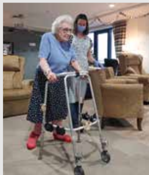
Revolutionary walking frame one step closer to reality Page 7