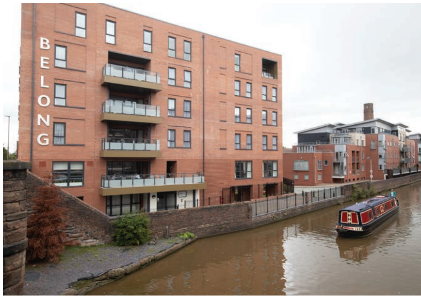
Canalside Belong Chester