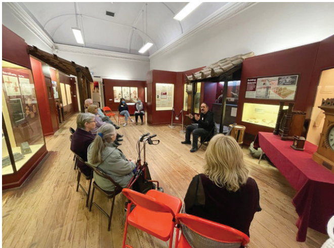
The Grosvenor provided the venue for Bluecoat art sessions

The Meet and Make Art project was a collaboration between Belong and Bluecoat, Liverpool's centre for contemporary arts. Based at the Grosvenor Museum, participants were afforded the opportunity to get up-close with artefacts, rich in Cheshire's history, from the museum's collections.