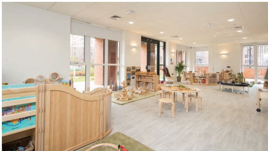
The Nursery in Belong