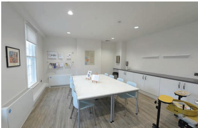
Creative studio within Belong