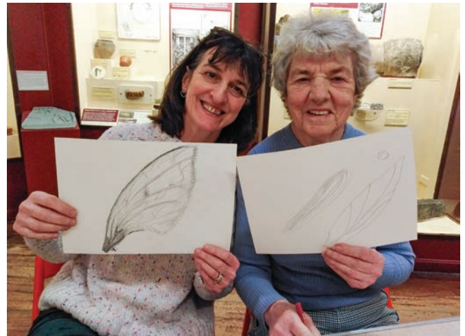
Meet and Make Art workshop