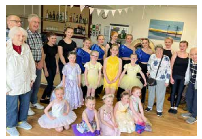
KAM Performing Arts Academy at Belong Wigan.

The audience included residents, apartment tenants and Belong at Home customers who were supported to visit the village for the performance by the community support team who had organised the event. One relative commented: "It was amazing; mum absolutely loved it!" while another said: "Thank you Belong for organising this; it meant our dad could see his granddaughters perform again."