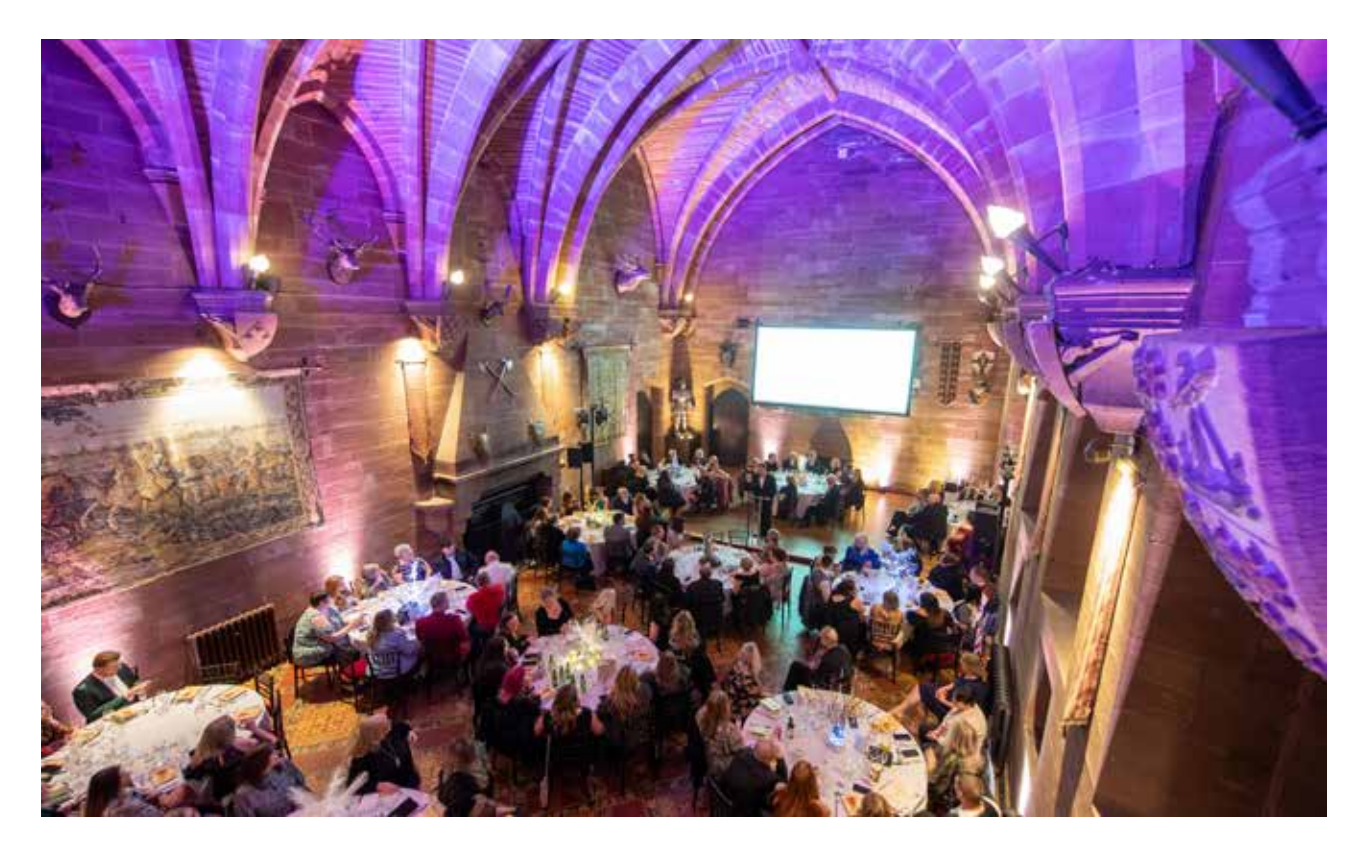
In 2022, we relaunched the Champion Awards post-pandemic, giving us the opportunity to recognise and celebrate the many achievements of colleagues in Belong villages and in Belong at Home.