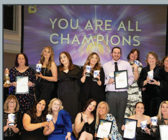
Belong colleagues celebrate their success

We're looking to recruit experienced support workers, as well as nurses and bistro staff. Join an organisation that believes in recognising the achievements of our colleagues, as seen in the recent celebration of our annual Champion Awards