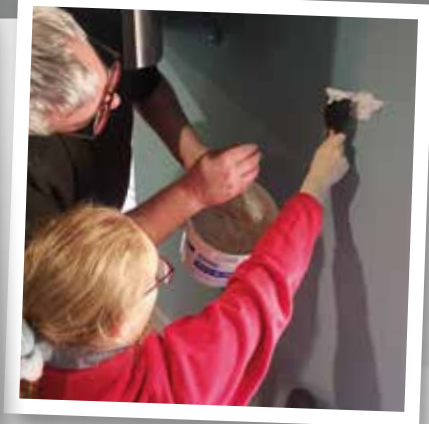
Pictured: Students enjoyed working with colleagues at the village.