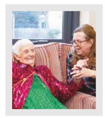
Belong launches B's dementia cafés Page 5

Belong strengthens leadership team with new appointments: see pages 2 - 3