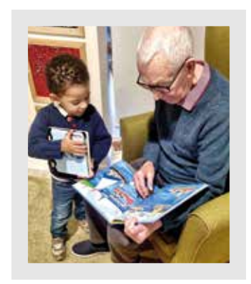
Residents named intergenerational champions Page 10