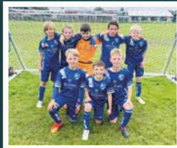
Pictured: The team in their Belong at Home kits.