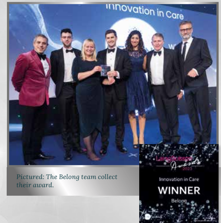
Pictured: The Belong team collect their award.

At Belong Chester, an intergenerational practice lead works with village and nursery teams to support the planning, co-ordination and evaluation of a range of intergenerational opportunities, including weekly stay-and-play sessions, a multi-generational choir, storytelling, poetry and dance workshops.