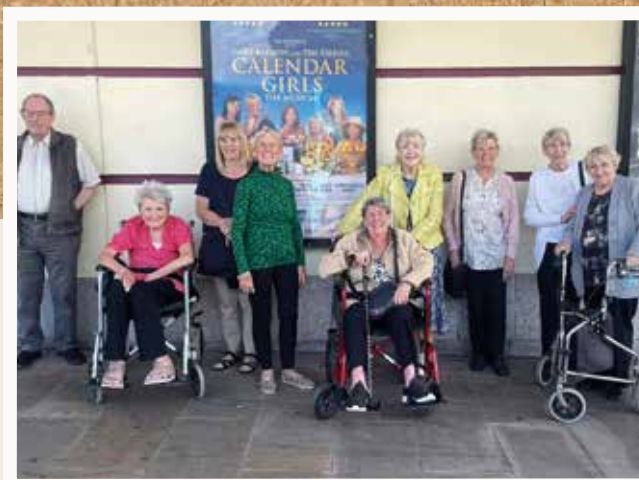
The group outside the Liverpool's Empire Theatre.