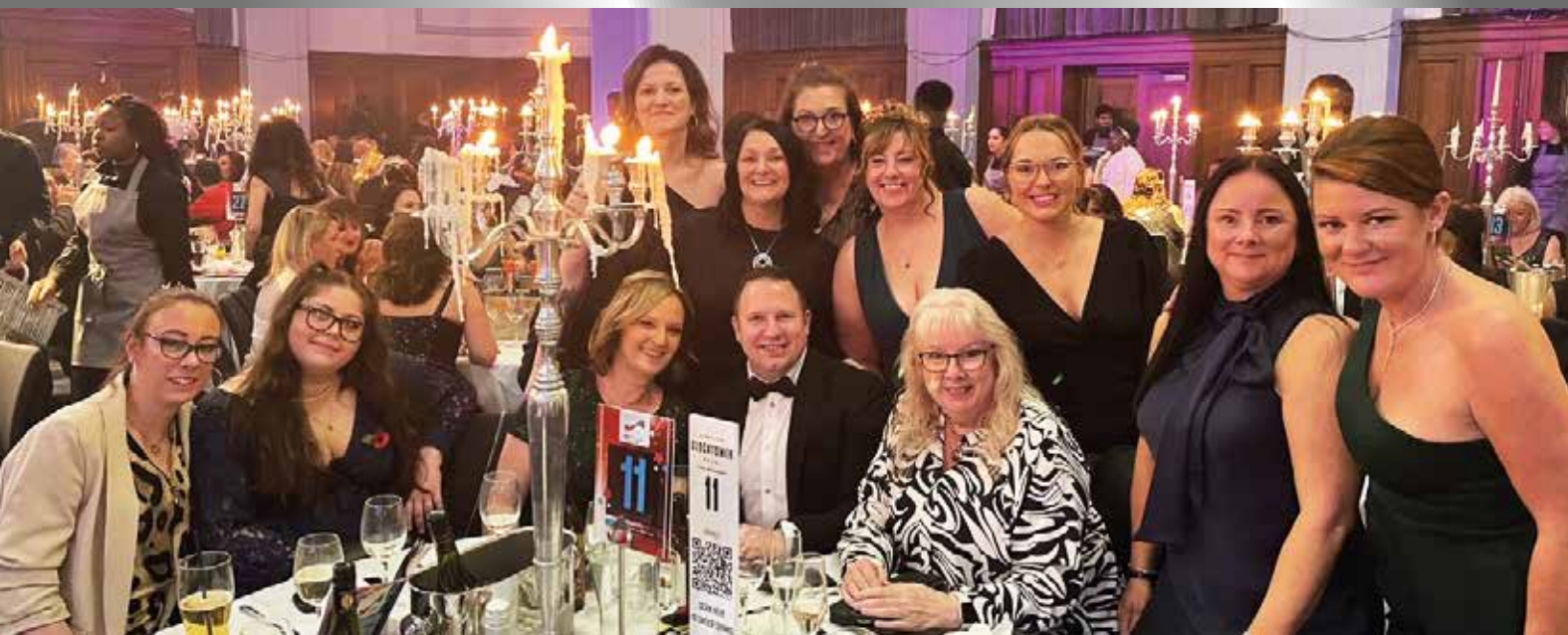
Pictured: Belong GBCAs North-West finalists

Belong colleagues have been celebrating being recognised for excellence in their fields at the Great British Care Awards, securing a fantastic 16 nominations and three wins at the 2023 regional finals.