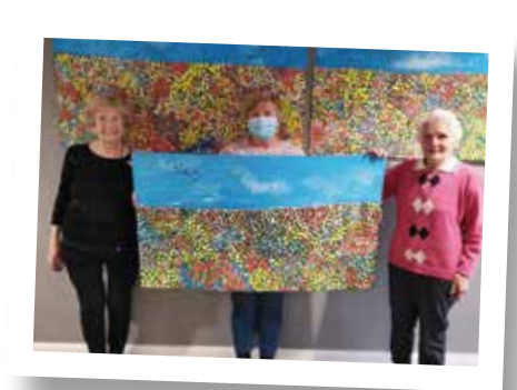
Pictured: Belong Newcastle-under-Lyme

Customers, families and community visitors in Belong Newcastle-under-Lyme produced a spectacular wall art piece, featuring four thousand individual fingerprints in vibrant colours, arranged across canvases to create a display feature in their village's integrated heritage gallery.