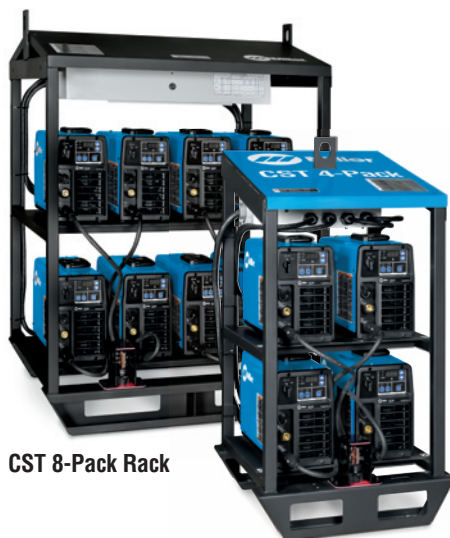
CST 8-Pack Rack