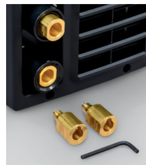
CST 282 with Tweco-style receptacles shown.