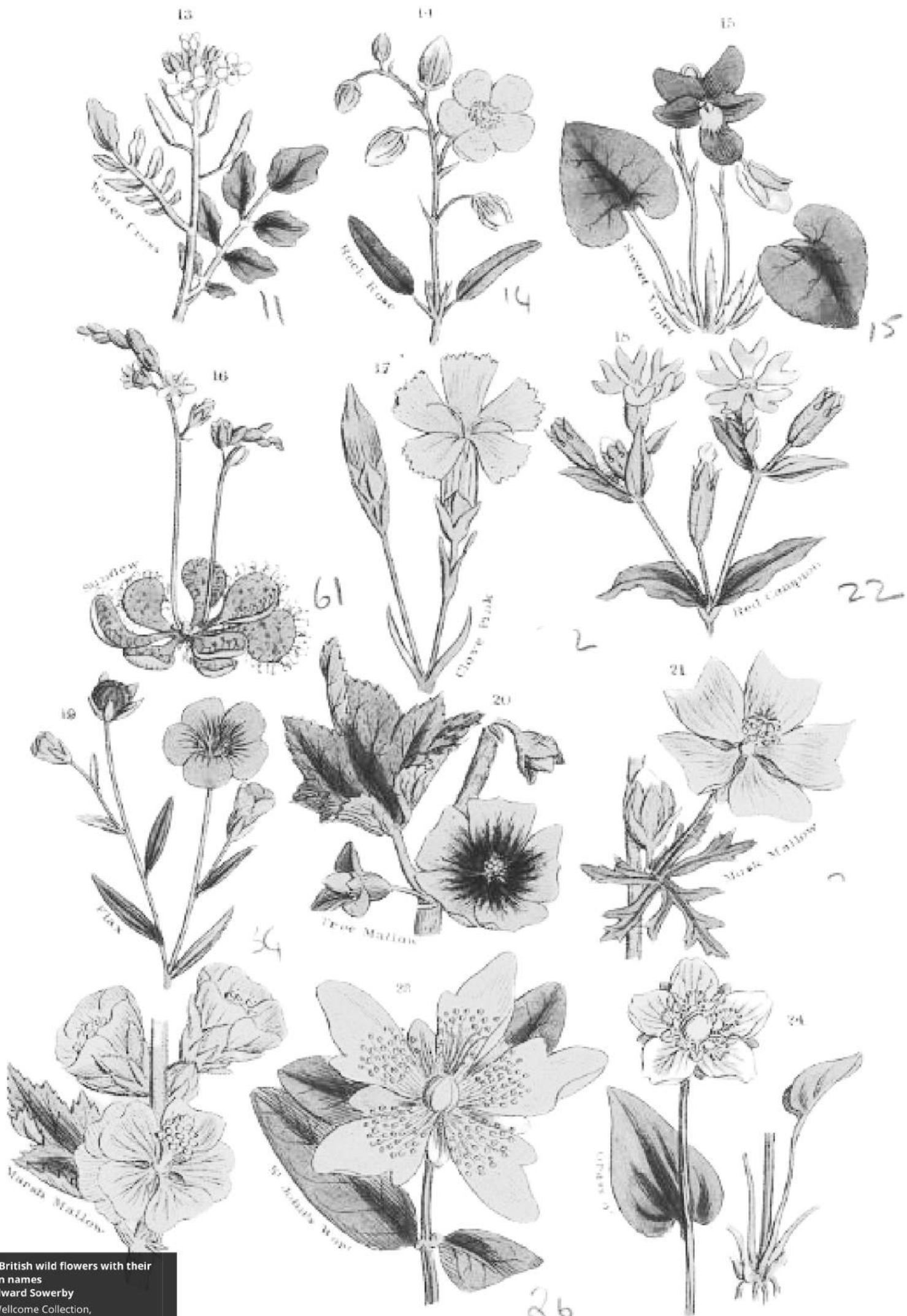
Twelve British wild flowers with their common names John Edward Sowerby 1861