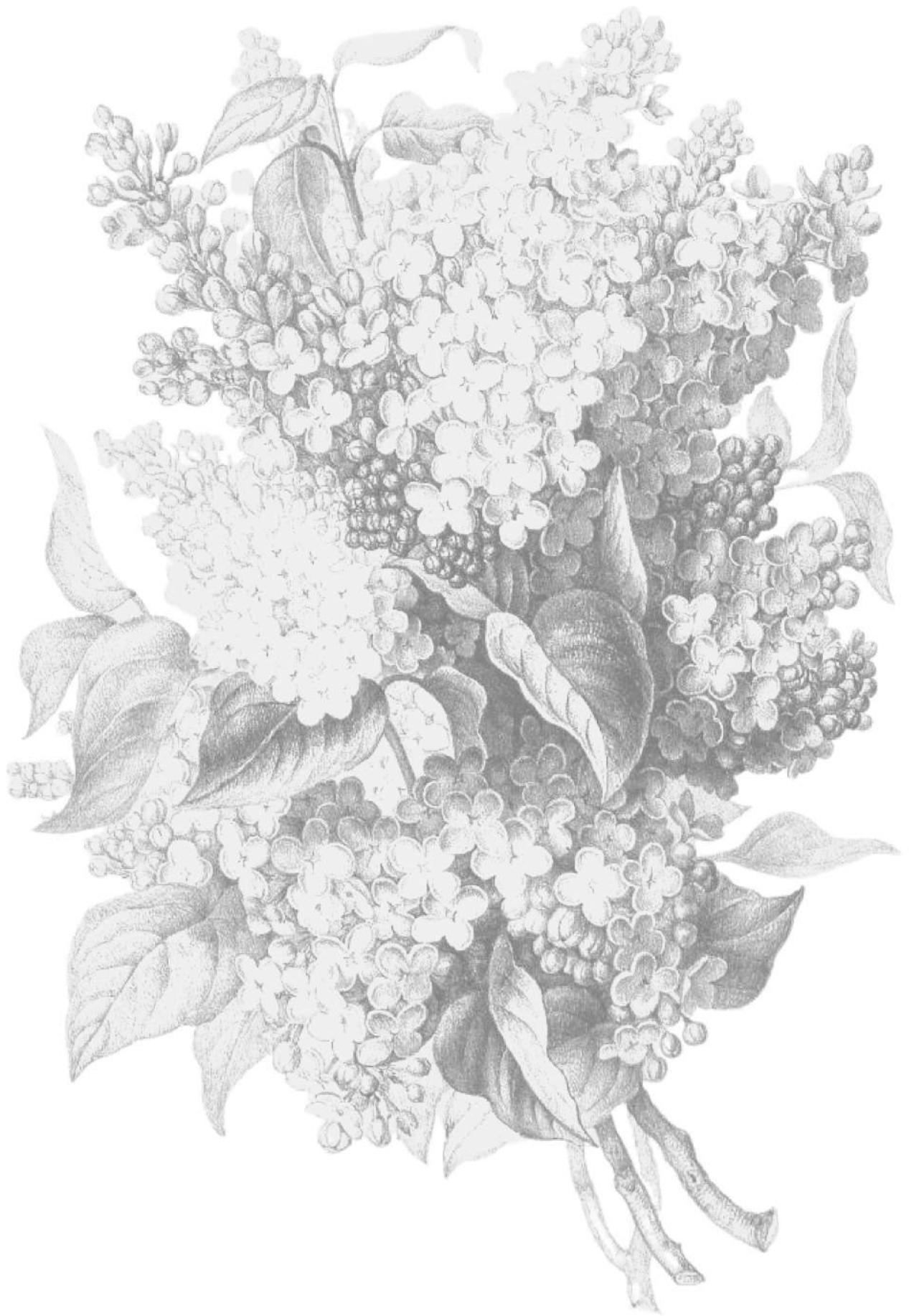
A bunch of flowering lilacs Elisa-Honorine Champin 1850 - Wellcome Collection United Kingdom, CC BY