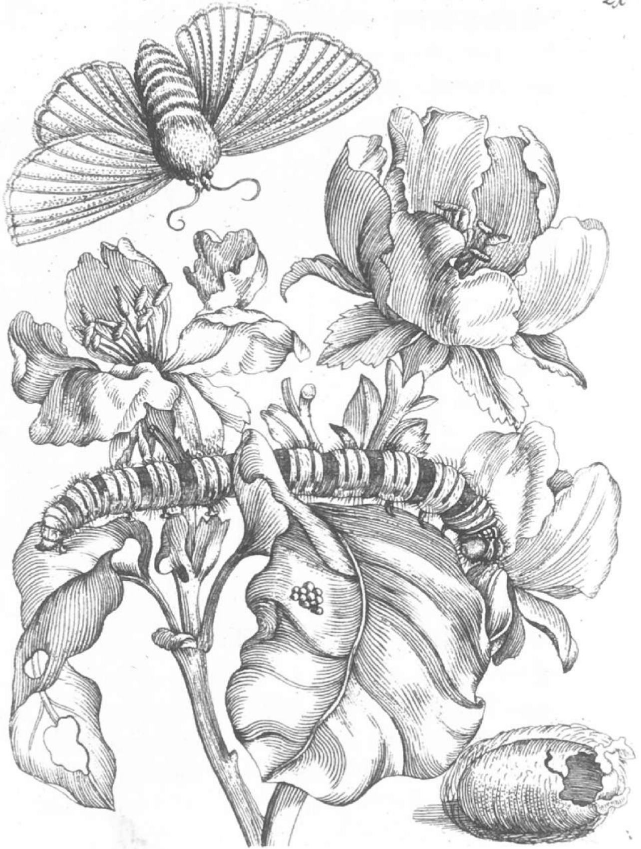
Quitzenblüe / Cotoneae flos Maria Sibylla Merian