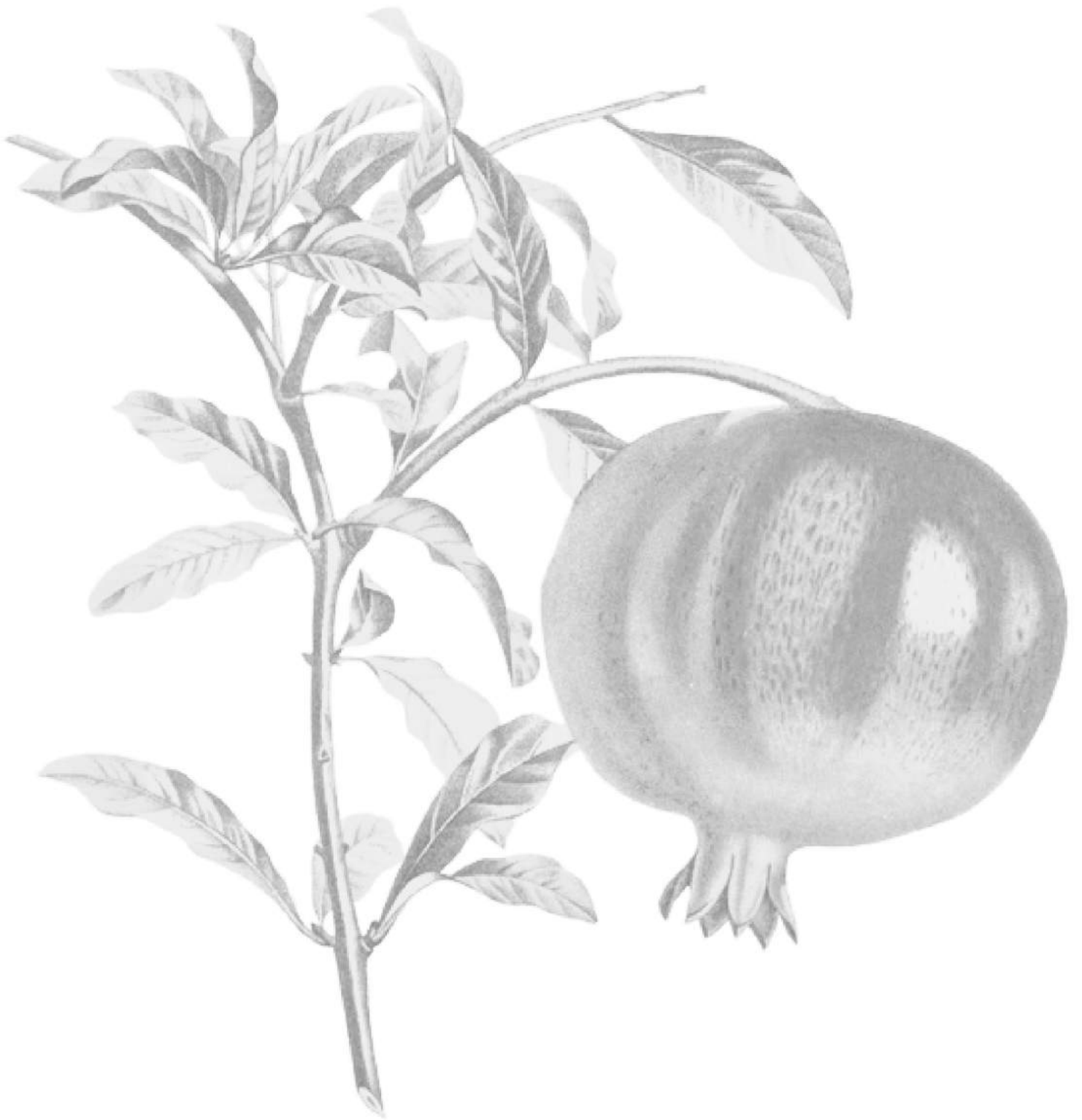
Tak met granaatappel 1800 - Geldersch Landschap & Kasteelen, Netherlands - Public Domain