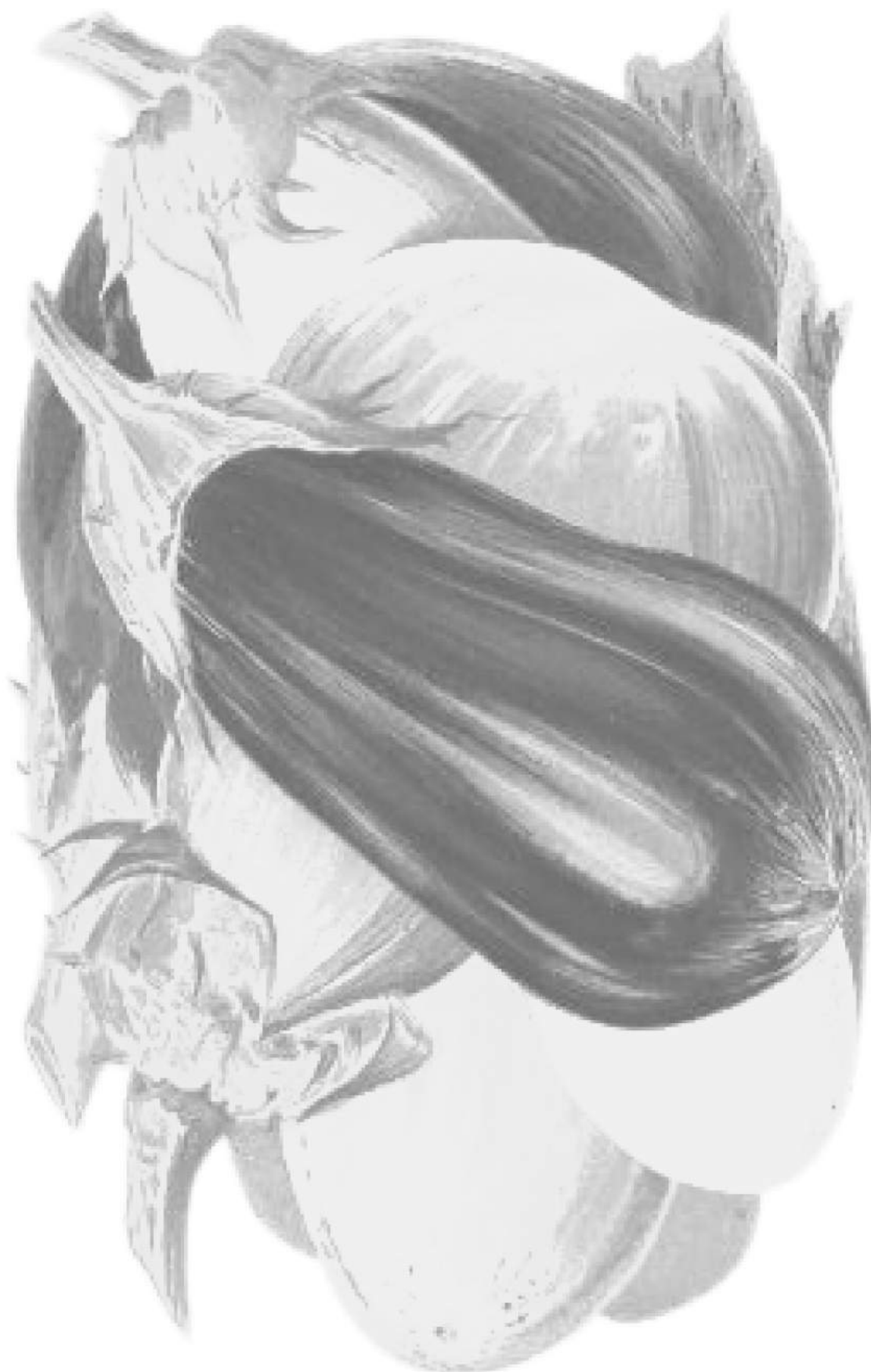
Aubergine or egg plant, fruits of different varieties.