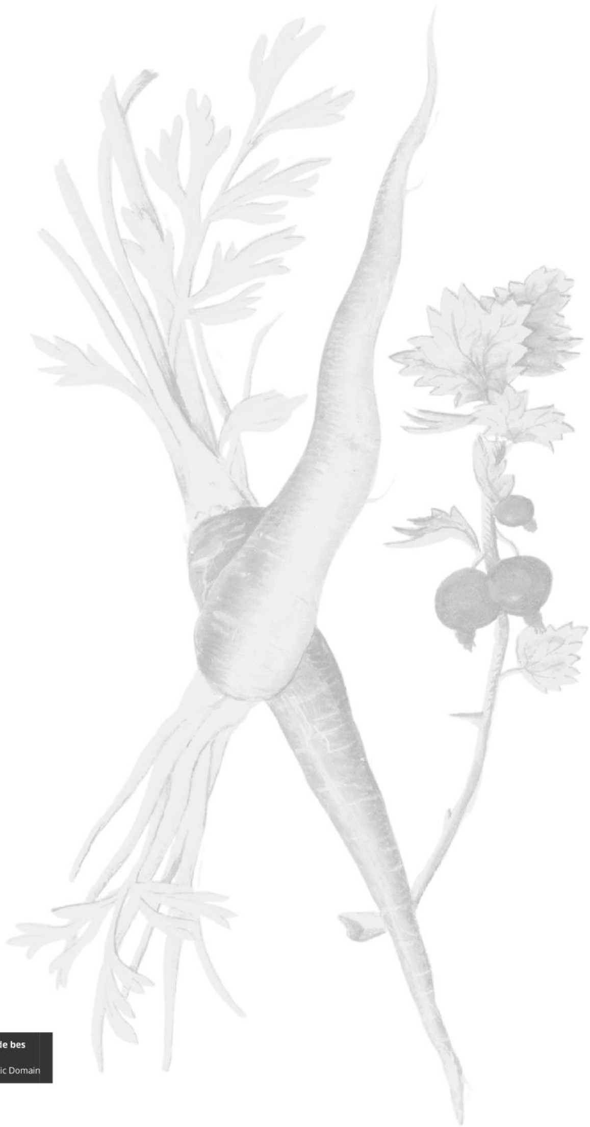
Wortel ( Daucus carota ) en rode bes ( Ribes rubrum )