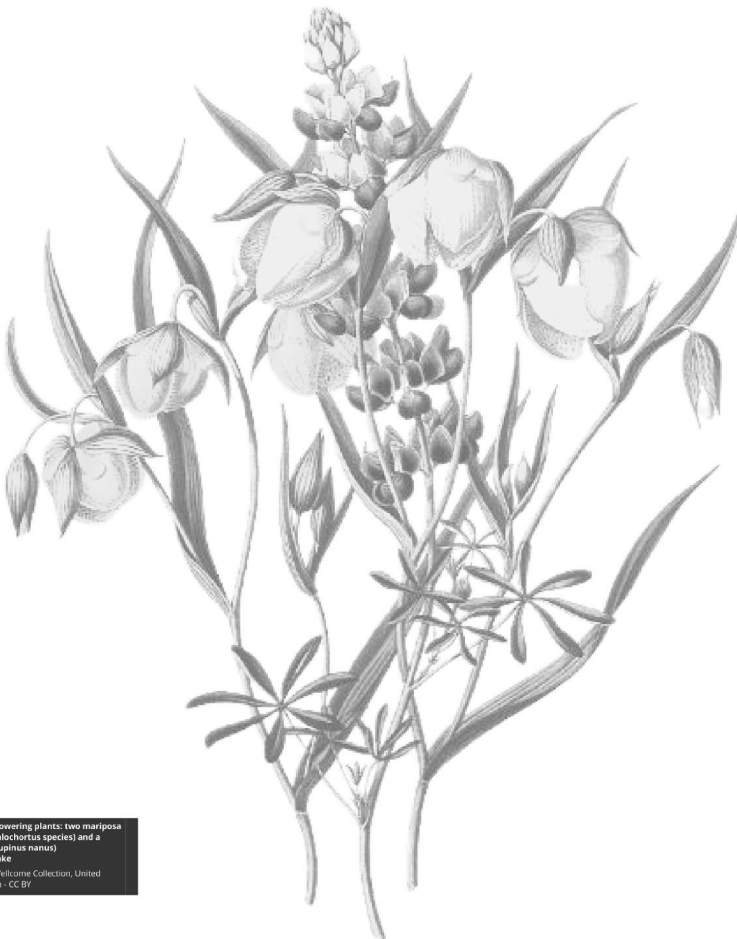
Three flowering plants: two mariposa lilies ( Calochortus species) and a lupin ( Lupinus nanus ) S. A. Drake

1835 - Wellcome Collection, United Kingdom - CC BY