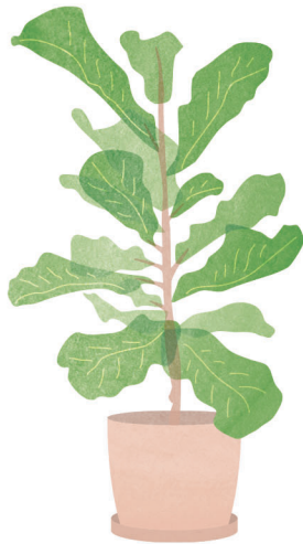
Fiddle Leaf Fig