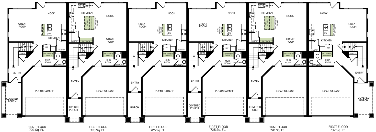
FIRST FLOOR 702 Sq. Ft.