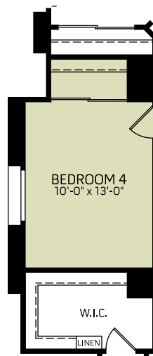
OPTIONAL BEDROOM 4