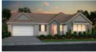
B: Farmhouse Victorian