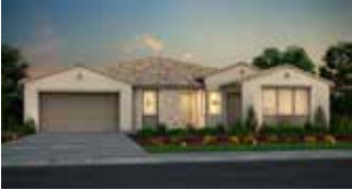
A: Mediterranean Revival