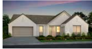
C: European Country