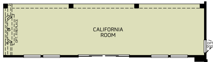
OPT. CALIFORNIA ROOM