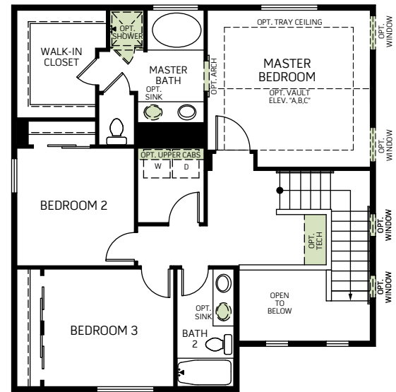
SECOND FLOOR 908 Sq. Ft.