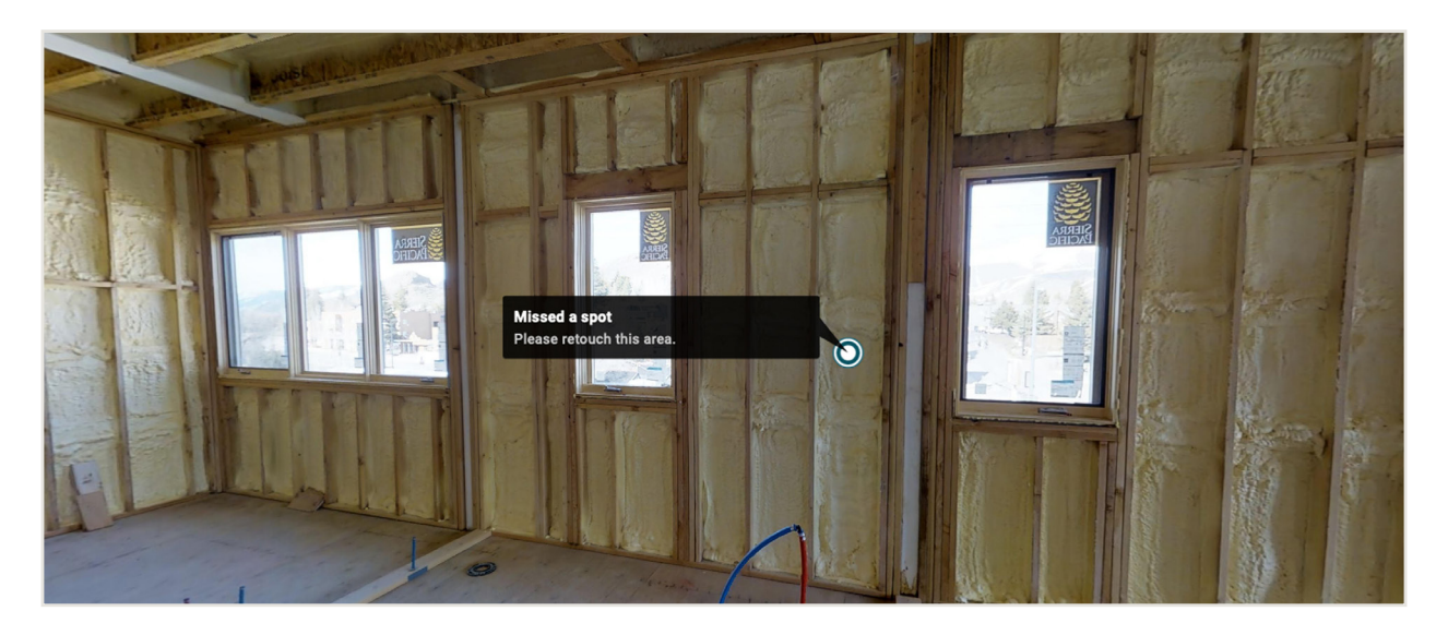
Matterport Showcase Procore integration with Mattertags.