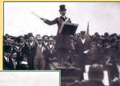
Henry Bell conducts the orchestra during the 1904 Annual Festival in Vernon Park

Henry Bell also gifted to the public the corner of land where Cale Green meets Bramhall Lane, now known as 'Bell's Paddock'. This small area supports many mature trees and produces a bright display of daffodils each spring.