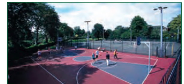
Basketball & Netball Courts

Local community organisations and schools get involved with task days and events in the park.