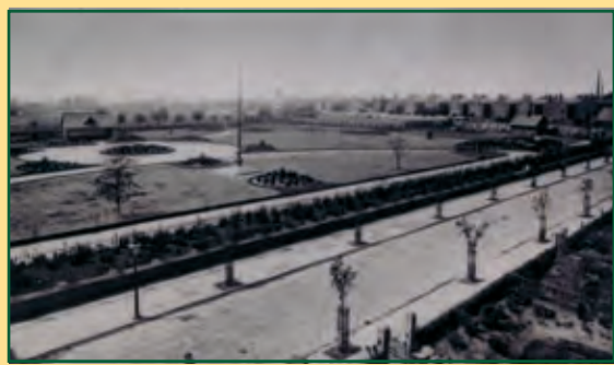
An illustration of the parks original layout viewed from Heath Road