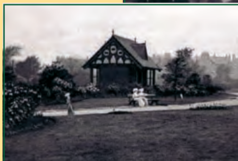
Residents enjoying the park in Edwardian times