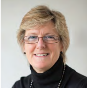
Professor Dame Sally C Davies Chief Medical Officer Chief Scientific Adviser Department of Health & Social Care

Although many of us enjoy the sunshine, as a result of climate change we are increasingly likely to experience extreme summer temperatures that may be harmful to health. For example the temperatures reached in 2003 are likely to be a 'normal' summer by 2040, and indeed globally, countries have already experienced record temperatures. We do not know whether or not there will be severe heat over the course of this summer, but we do want to make sure that everyone takes simple precautions to stay healthy during periods of hot weather and when in the sun.