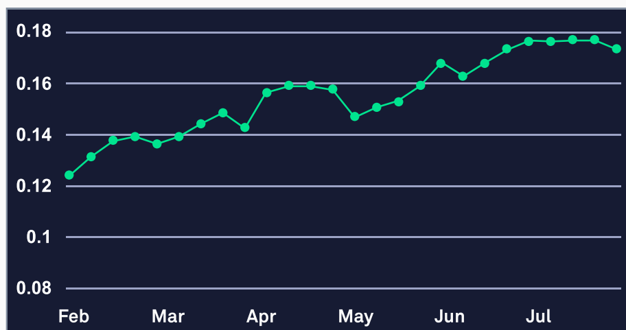
July Airfare Prices