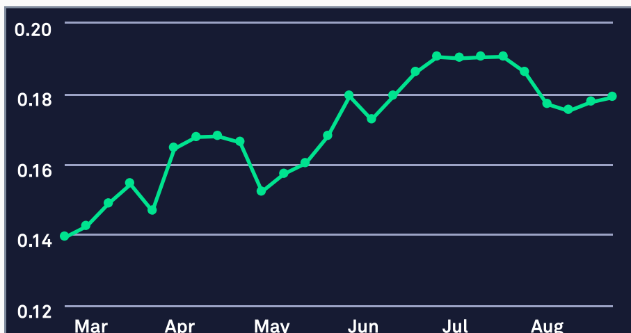
August Airfare Prices