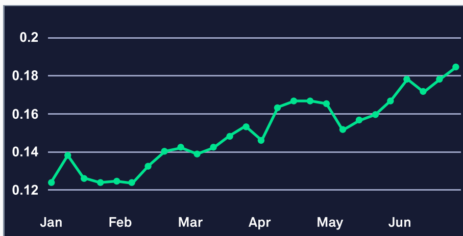
June Airfare Prices