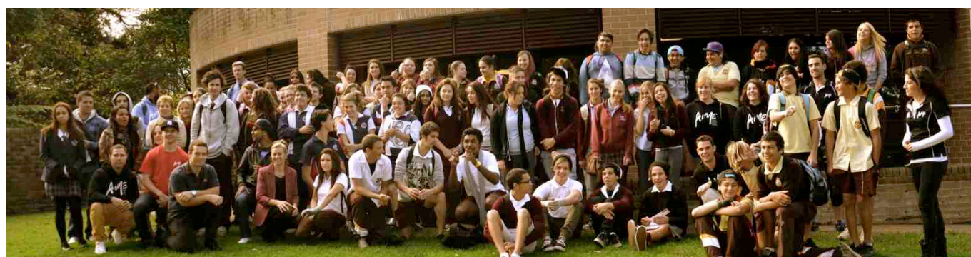
The 1 st UOW Outreach day for 2012.

This year we have also seen a number AIME Mentees entering university through the Woolyungah Indigenous Centre (WIC). The transition from Mentee to Mentor is beginning to surface, with WIC having a record number of Indigenous students signing up to enter university both within our Core and Outreach schools. The AIME Program is highly regarded within the Illawarra region and we would love to see AIME grow even bigger and be accessed by even more schools!