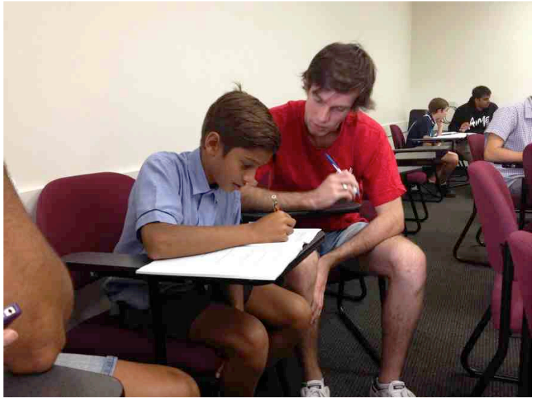
A Year 9 Mentee bonding with his Mentor in the 'Getting to Know You' session on the Gold Coast.

show what it means to be a successful Indigenous Australian. AIME Gold Coast is also seeing a lot of familiar faces with many of last year's Mentees progressing to the Year 10 Program and tackling each session with more confidence. Many Mentors are backing up last year's efforts by volunteering for another year, donning their red Mentor shirts and shaping their own experiences with Indigenous Australia. The Mentors from Bond and Southern Cross Universities continue to show high levels of commitment and strive to provide a supportive environment for students to explore their Indigenous identity. Inspired by an amazing bunch of Indigenous high school students, these future leaders are gaining first-hand experience of one of AIME's key messages: Indigenous means success.