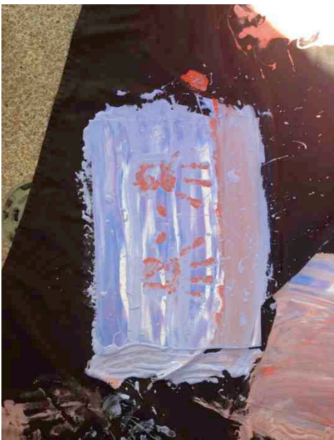
A student's artwork from the Art session on Identity.

"Since coming to university, AIME has been one of the most influential extra-curricular programs I have done."