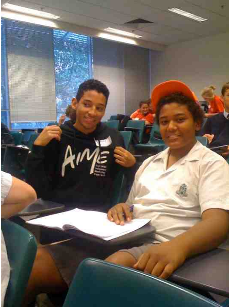
Randwick Boys High School Mentee and UTS Mentor getting to the bottom of respect during the Year 9 Interactive Program 'Respect' session.

With the introduction of our Outreach Program, AIME has been able to cater to the North West Sydney region with 48 Mentees across Years 9 to 12 having taken part in the first of our three Outreach Days. It has been refreshing, challenging and exciting to be connected with Mentees outside the East Sydney region and great to be able to extend the chance to be involved in AIME through our intensive version of the Year 9 to 12 Core Program.