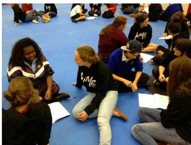
Mentors and students get to know each other at the first Year 9 and 10 session this year at RMIT Bundoora.

In our Core Program this year, we have continued to work with Thornbury High School, Reservoir High School and Bundoora Secondary School. We have also started working with students from Parade College and Roxburgh Secondary College.