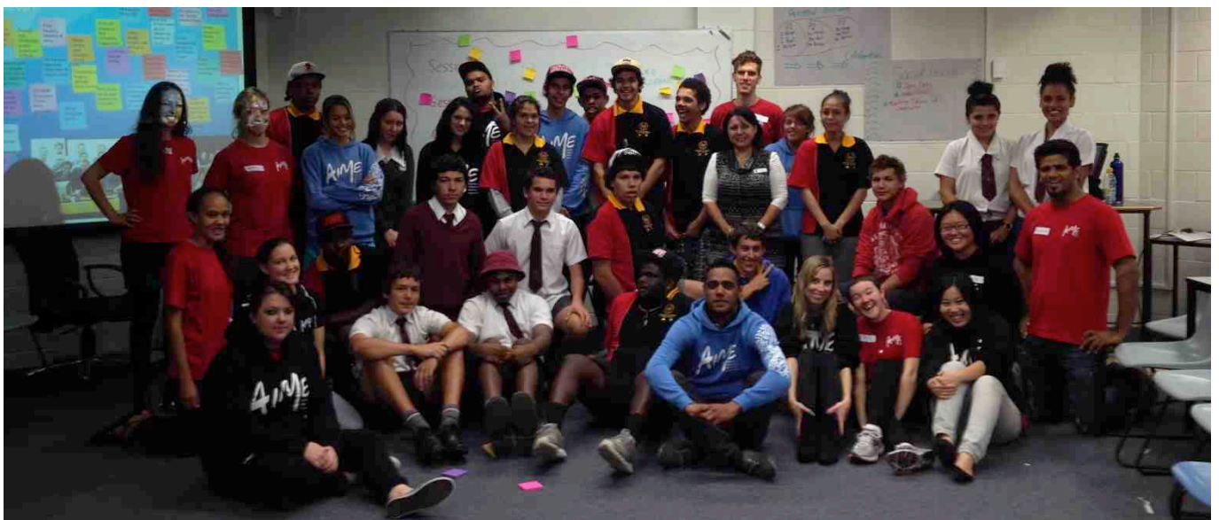
Year 11 and 12 Mentees and Mentors standing proud after their first Leadership and Development Day in Brisbane.