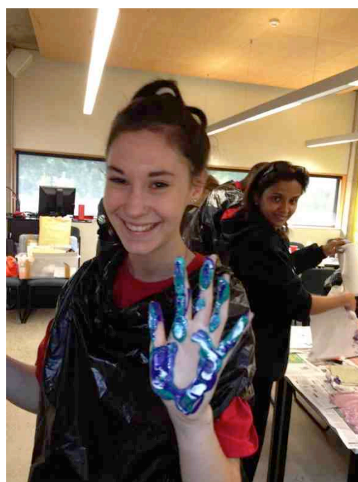
A Year 9 Mentee enjoying Art 1 at AIME Sunshine Coast.

With strong mid-year participation by Mentees and Mentors, the AIME Sunshine Coast team are looking forward to building on these established high standards during the second half of 2012. Keep walking with us and keep watching this space!