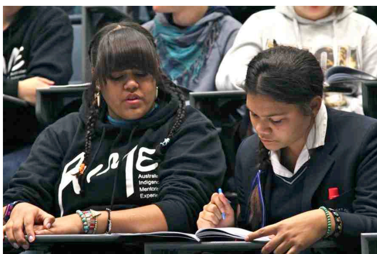
St Scholastica's Mentee and Mentor discuss the concept of respect during the Year 9 Interactive session.