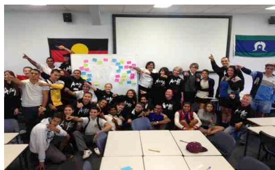
Year 11 and 12 students posing for a photo after setting goals for the next 6 months and the next 365 days.

AIME at Lismore got off to a flying start with almost 100 Mentees and Mentors registering for the first Outreach Program in the area. The first Outreach Day was attended by 39 students from Years 9-12 and the support from Southern Cross University (SCU), AIME's partner schools and the local community has been very encouraging. The Program is poised to grow over the next two Outreach Days scheduled for later in the year.