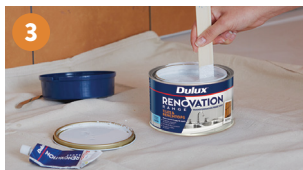
Add the additive and stir well