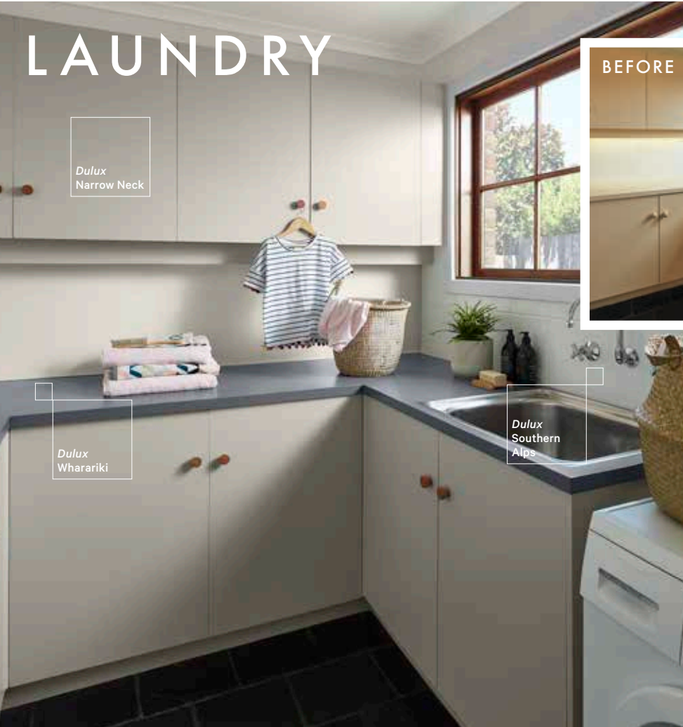
Dulux Narrow Neck