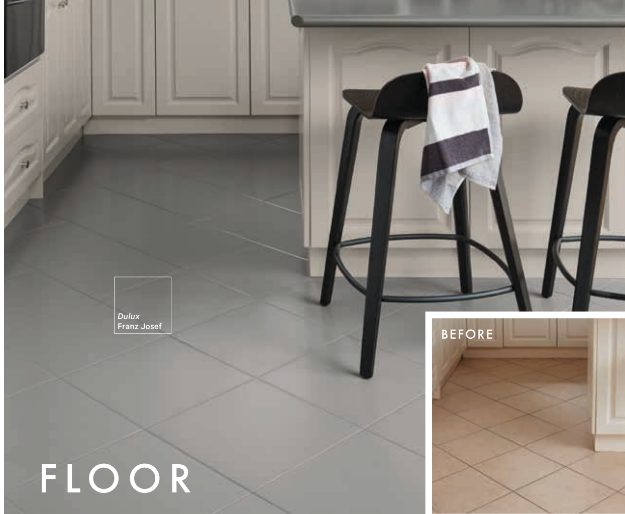
Dulux Franz Josef