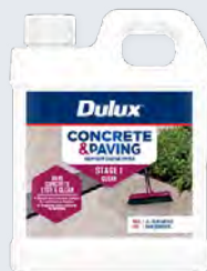
BARE CONCRETE ETCH & CLEAN