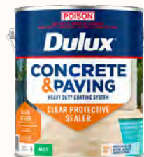
CLEAR PROTECTIVE SEALER