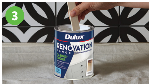
Stir well before use