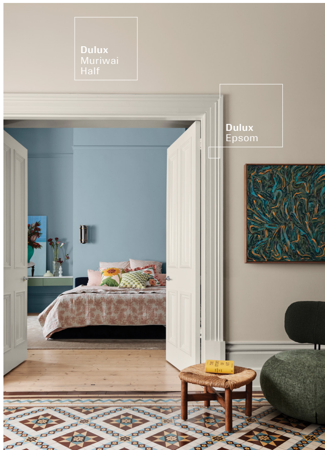
Dulux Muriwai Half