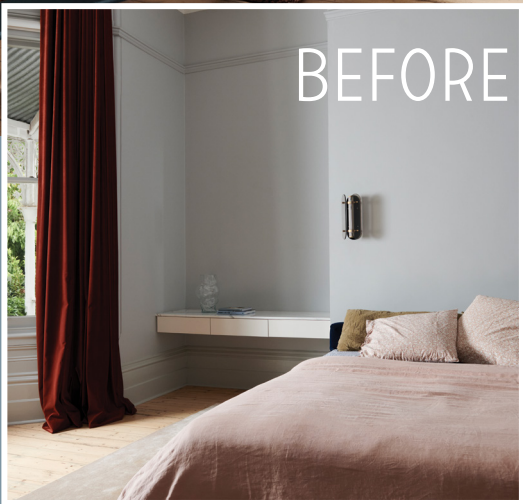
Dulux Te Horo