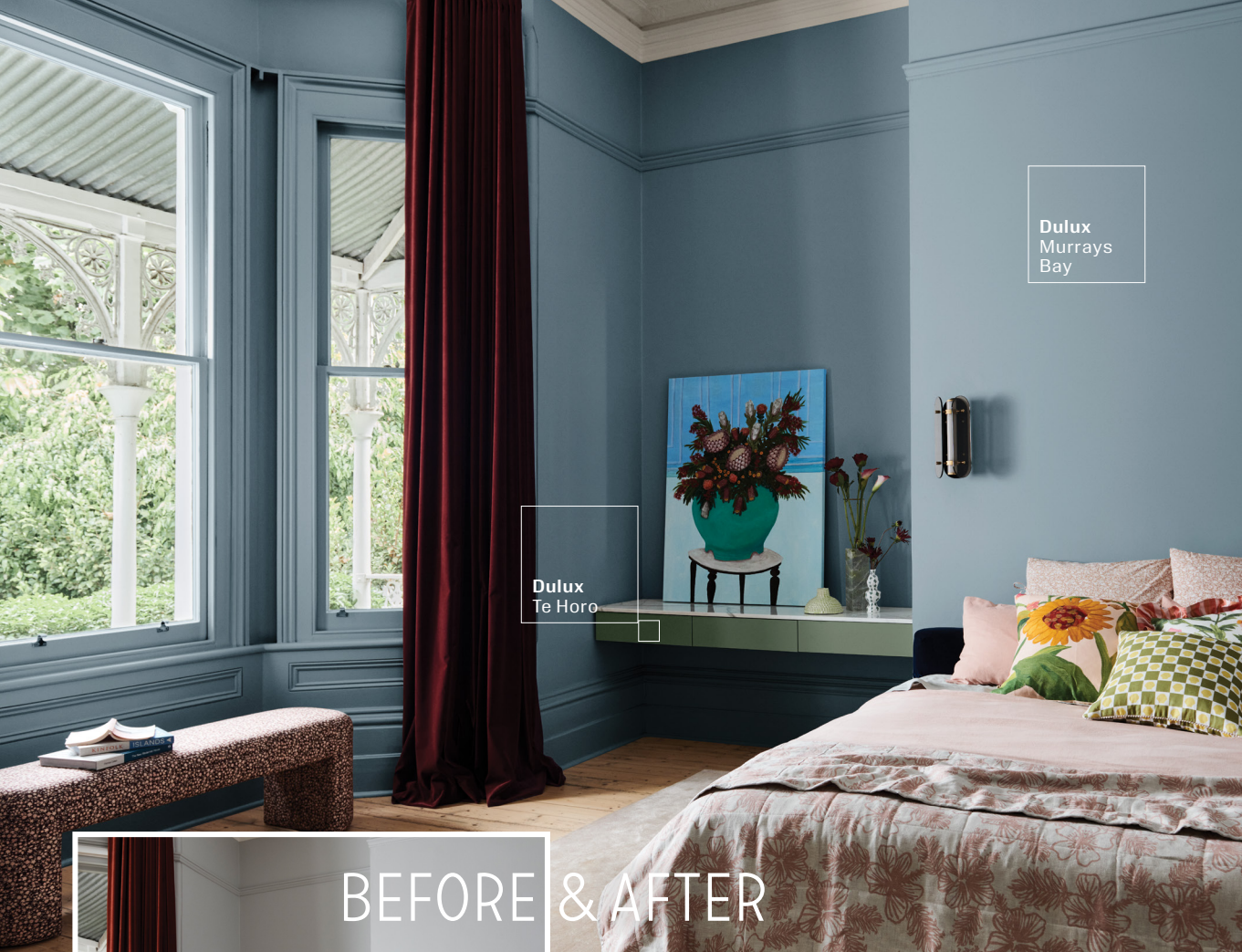
Dulux Murrays Bay