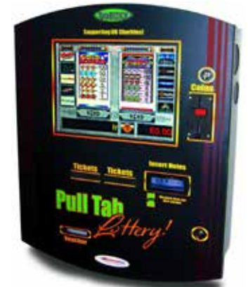
A typical pull-tab lottery ticket dispenser

A lottery ticket that is dispensed via a lottery ticket vending machine must comply with the Act and any requirements of the registration or licence held that are relevant to the type of lottery offered.