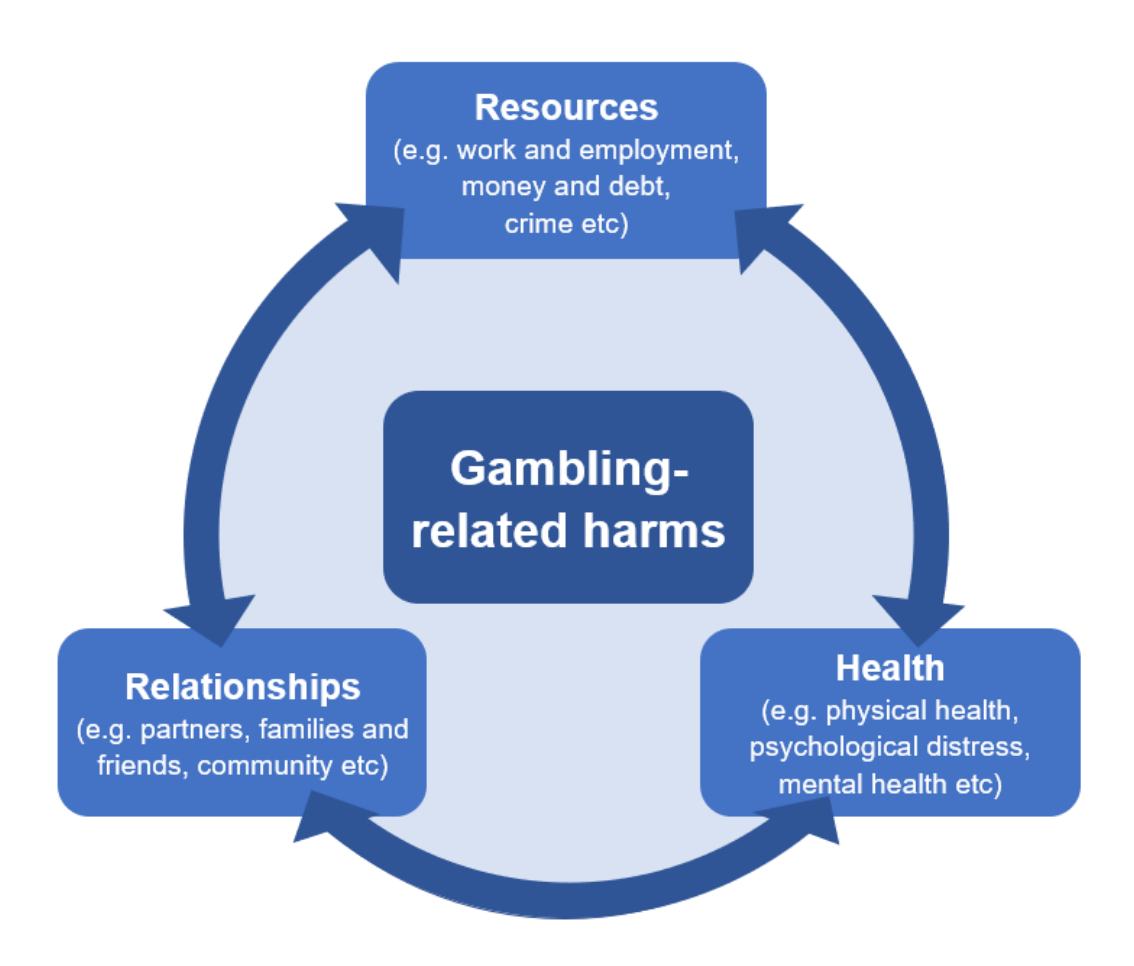
Figure 1: Overview of gambling-related harms

Finally, we acknowledge that some harms may be different for children and young people and that the proposed definitions presented here should be adapted and reviewed with children and young people in mind. This work is being currently being conducted, with likely outputs to be published in late 2018 / early 2019.