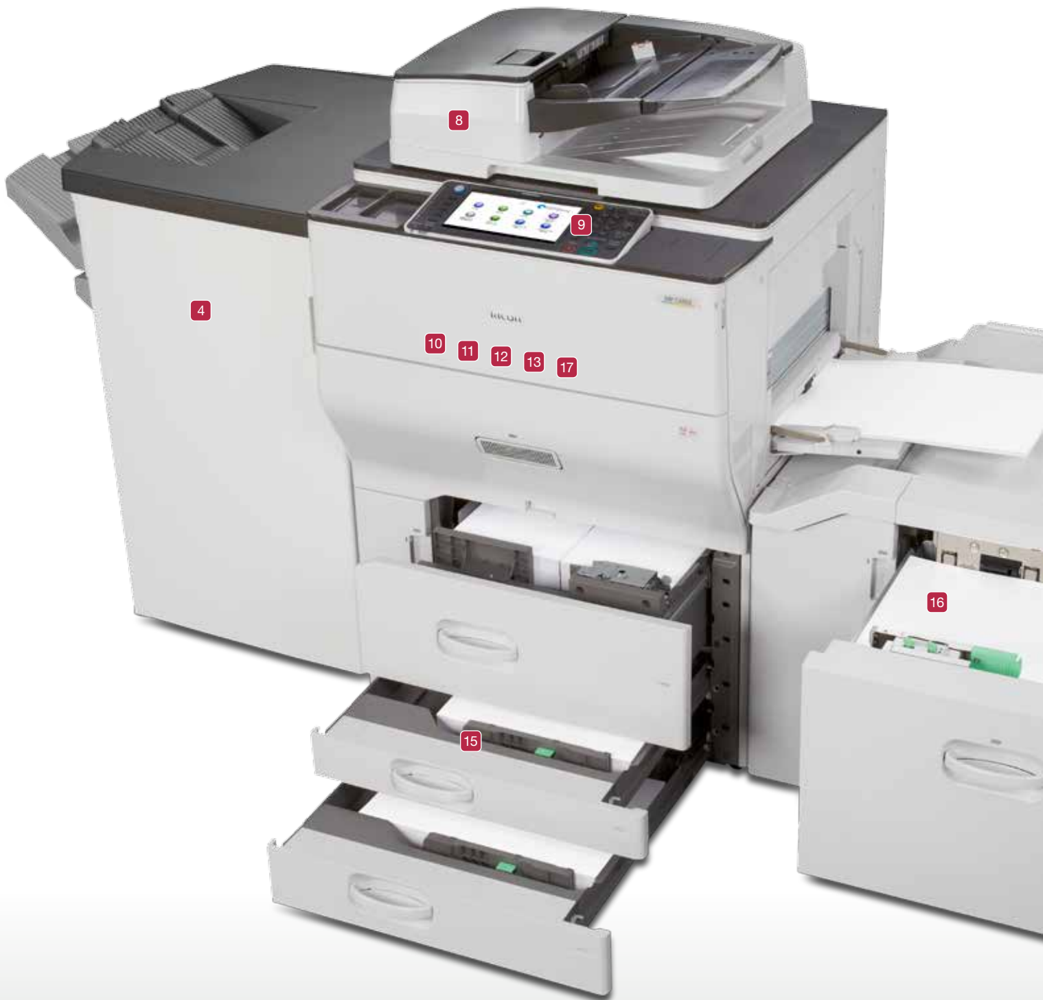
Ricoh MP C6502/MP C8002