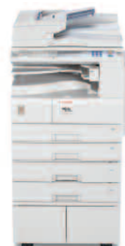
MP 2000SPF: Base model with standard copy, print, scan and fax capabilities, optional 50-sheet ARDF, standard 2 x 250-sheet and optional 2 x 500-sheet Paper Trays, standard One-bin Tray, plus optional Cabinet Stand.