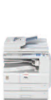
MP 2000: Base model with optional 50-sheet ARDF, standard 2 x 250-sheet Paper Trays, standard 100-sheet Bypass Tray and optional One-bin Tray.