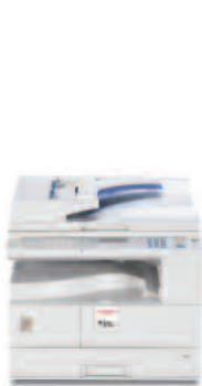
MP 1600: Base model with optional 30-sheet ADF, standard 250-sheet Paper Tray and standard 100-sheet Bypass Tray.