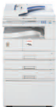
MP 1600SPF: Base model with standard copy, print, scan and fax capabilities, optional 30-sheet ADF, standard 1 x 250-sheet and optional 2 x 500-sheet Paper Trays, plus optional Cabinet Stand.