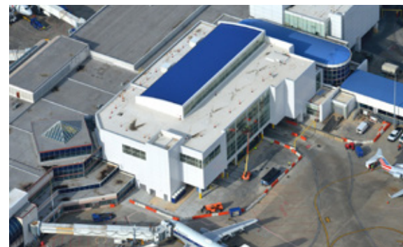
East Terminal Expansion

elevators. The project is approximately 85 percent complete.