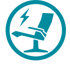
INTEGRATED CHARGING IN SEATS