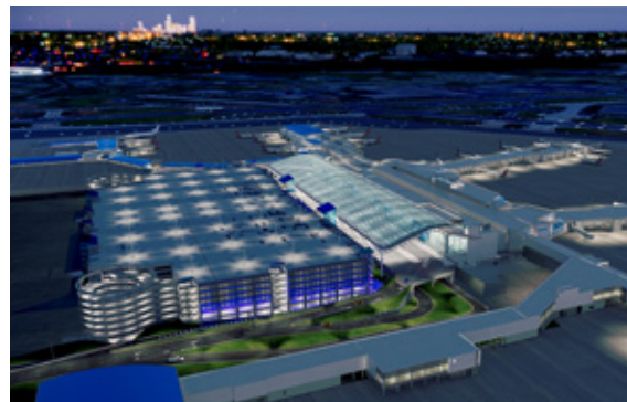
Terminal Lobby Expansion

Visit cltairport.com/destinationclt for construction updates. ♦