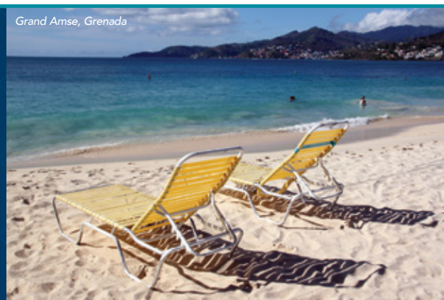
Grand Anse, Grenada

The $50 million roadway project is part of Destination CLT. continued on pg 3