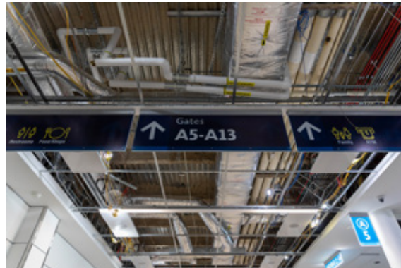
Concourse A Renovations