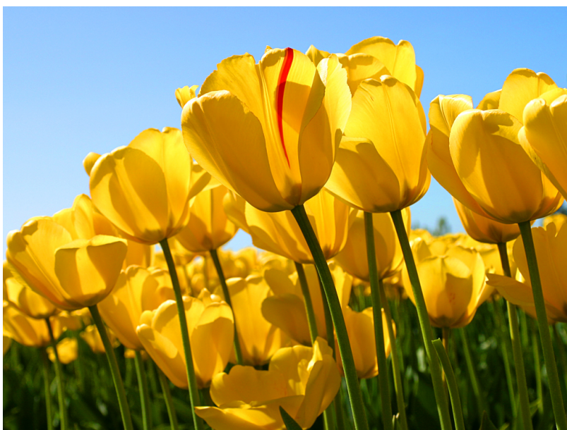
Fig. 2. This is the caption text.