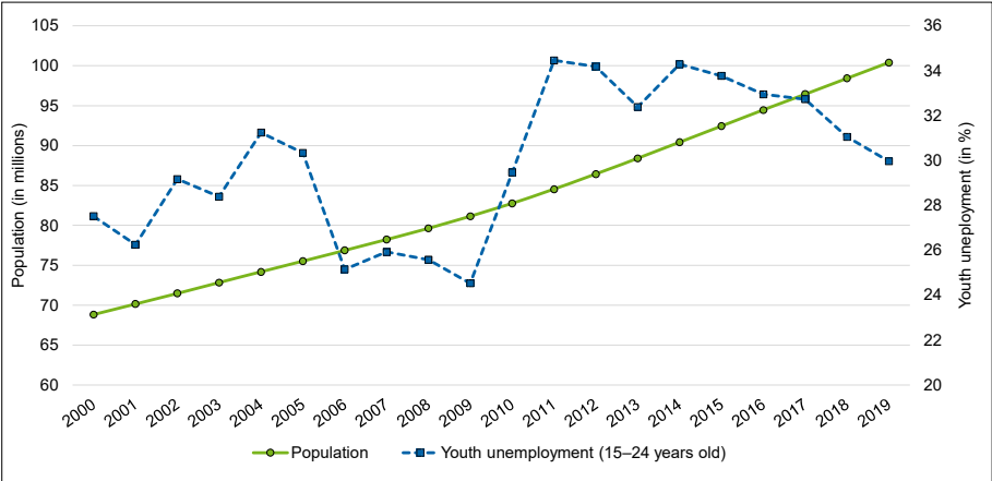
Figure 2 Population and Youth Unemployment in Egypt, 2000–2019

and other recreational spaces. In a similar vein to physical living conditions, the civilian government also continues to struggle with providing social security and welfare services to the continuously growing population.