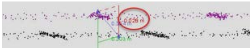
Fig 3: Vertical profile 2 runs before LiDAR QC Tools

The vertical difference between the runs was a maximum of 2.5 cm, falling within the expected range of accuracy. However, LiDAR QC is capable of correcting for this difference, ensuring a 100% match between the runs. The screenshots below illustrate the impact before and after using LiDAR QC Tools.