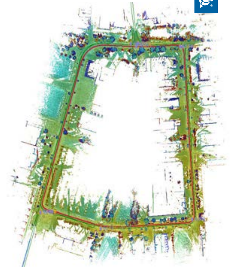
Fig 2: Below - Entire GNSS-INS Trajectory, Above - LiDAR recorded loops

The vertical GCPs were positioned along the road without any accompanying identification marks. In contrast, the 3D points are discerned as road paintings or manhole covers within the point cloud.