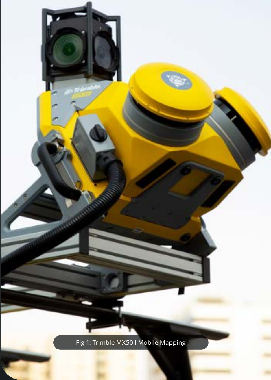
Fig 1: Trimble MX50 | Mobile Mapping