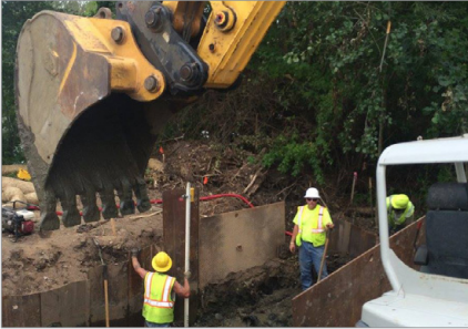
Kalamazoo River Valley Trail, Seg 5, Galesburg, MI.