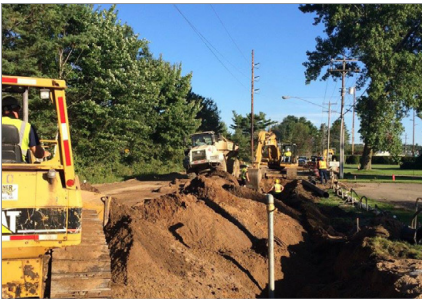
172nd Avenue/Johnson Street/168th Avenue, Grand Haven Twp, MI.